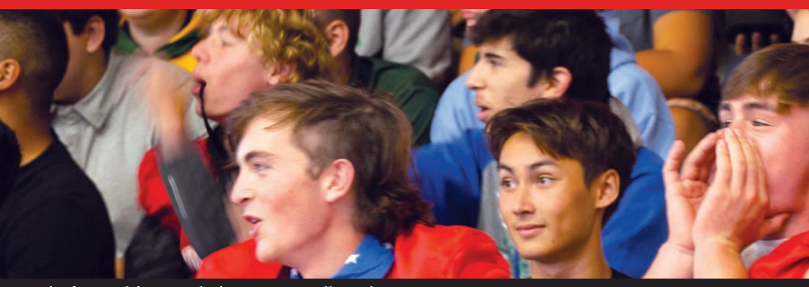
Chieftains celebrate at the homecoming rally in the gym