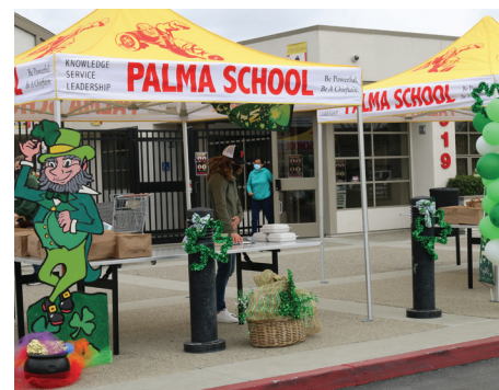
St. Patrick's Luncheon 2021