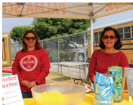
Red & Gold Day 2021