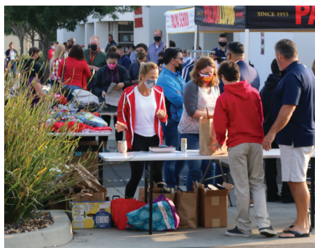
Palma Closet 2021