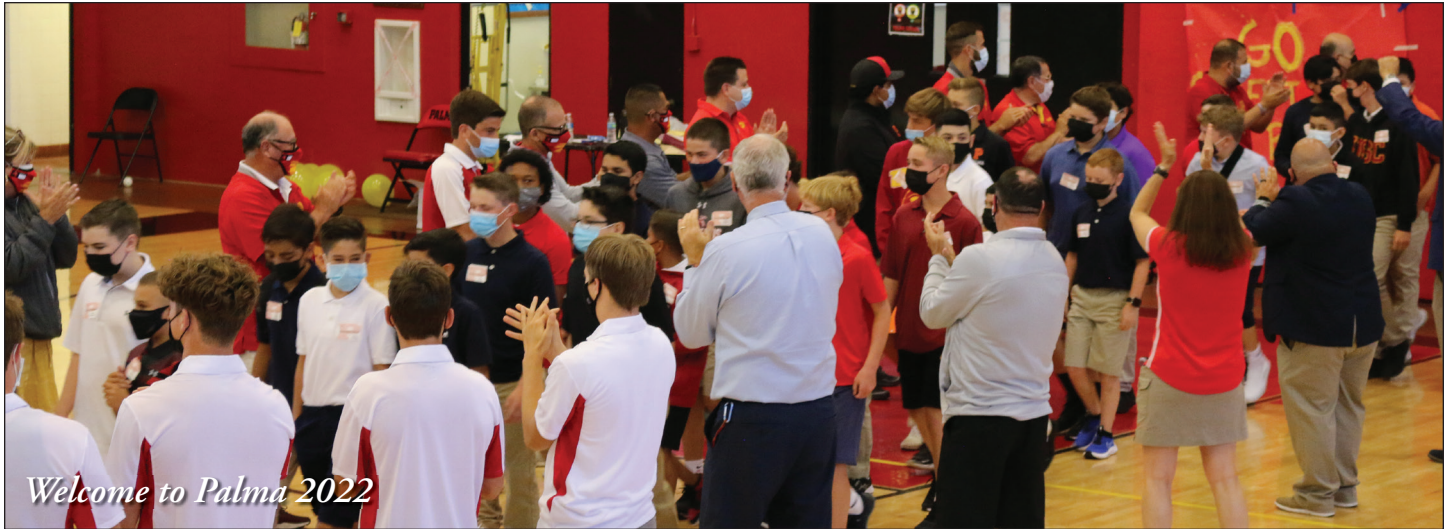
Welcome to Palma 2022