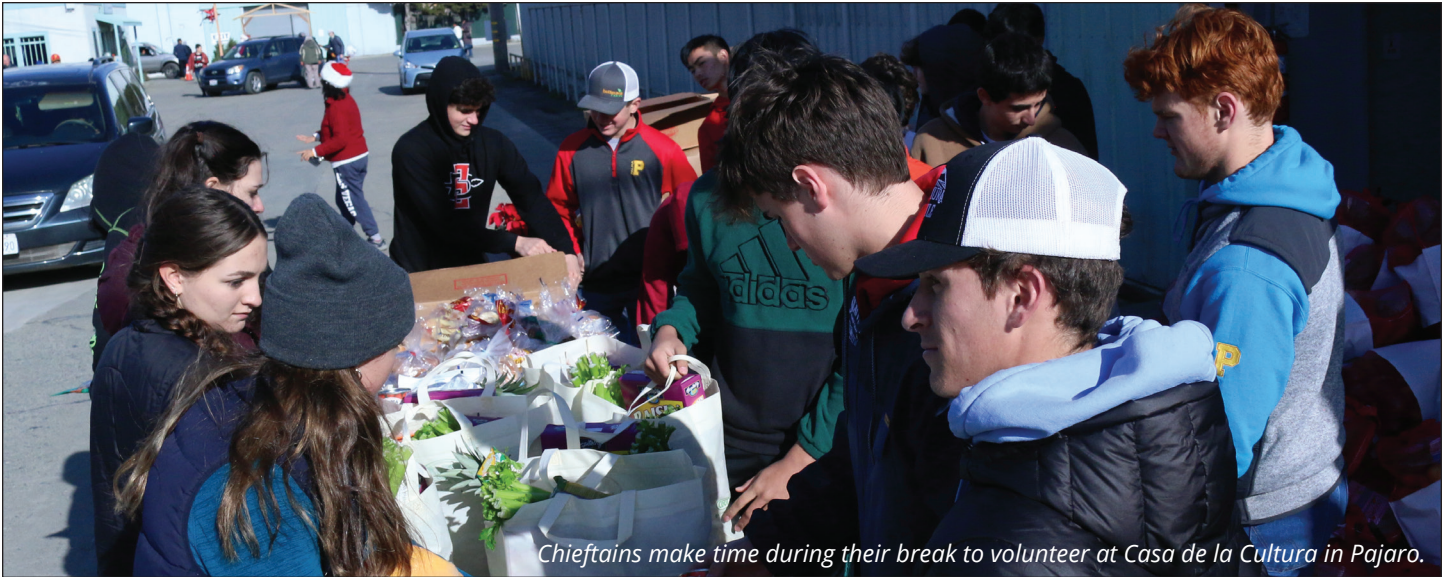
Chieftains make time during their break to volunteer at Casa de la Cultura in Pajaro.