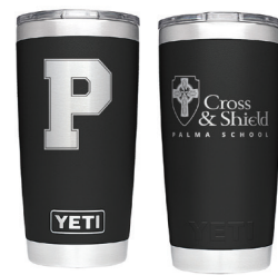
Yeti® travel mug engraved on the front and back

$50 a significant contribution to our Chieftains MONTH