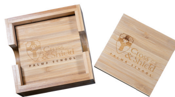
Laser etched solid wood coaster set

$19 enriches students' educational experience MONTH