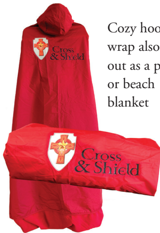
Cozy hooded wrap also lays out as a picnic or beach blanket

$70 to honor the 70th anniversary of Palma School MONTH