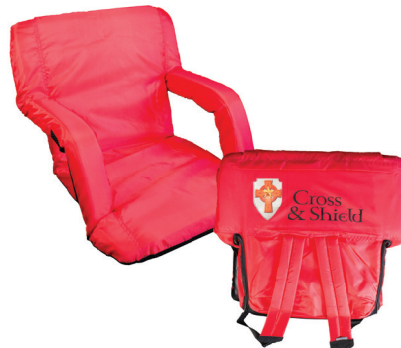
Comfortable stadium seat with arms and back support that folds into a backpack for easy carrying

$100 an incredible investment in our young men MONTH