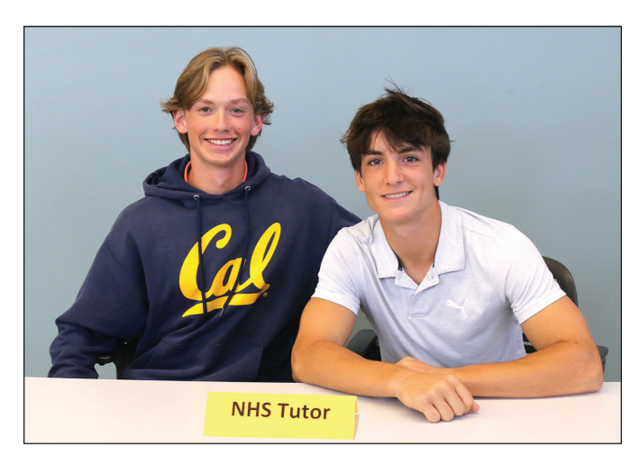
Tutoring is available in the Cislini Study Center Monday-Thursday after 2:45pm

The Palma Chapter of the National Honor Society (NHS) is providing on-campus tutoring for any student who would benefit from additional help outside the classroom. Palma's NHS members are Juniors and Seniors with a cumulative G.P.A. of 3.5 or higher who are committed to serving fellow Chieftains as peer tutors. Those who would like to receive tutoring help simply go to the Quiet Study Area of the Study Center and look for the "NHS Tutor" signs on the tables where tutors are waiting. If the tutoring session is successful, the student can arrange for additional tutoring on a regular basis.