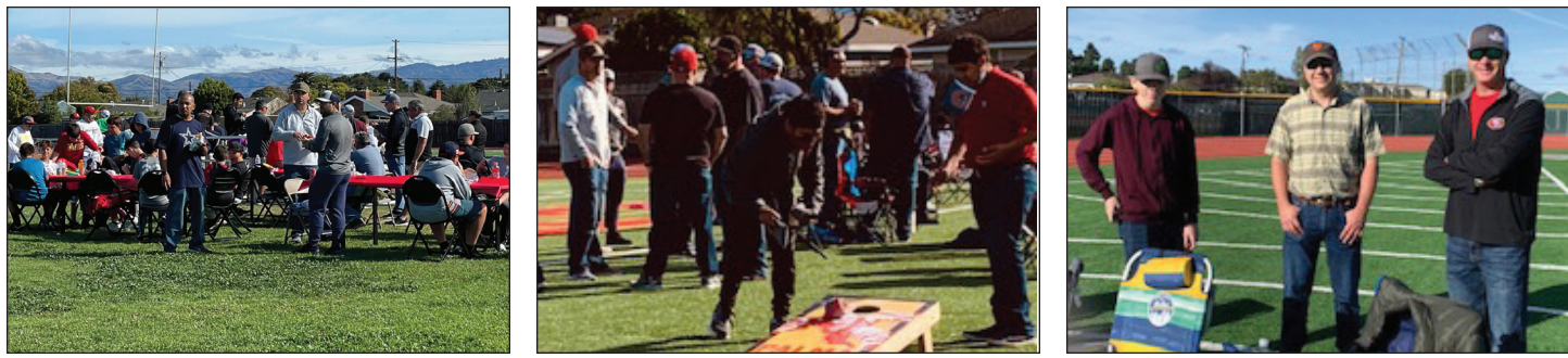
Last year's Day on the Green

PARENTS'CLUB WEB PAGE:HTTPS://PALMASCHOOL.ORG/PARENTS-CLUB/ EMAIL: <u>PARENTSCLUB@PALMASCHOOL.ORG</u>