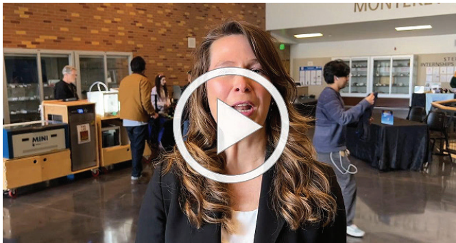
Click to see highlights of last year's event

Saturday, April 20, 2024 · 10:00am to 2:00pm Willard Lewallen STEM Center, Hartnell College Main Campus