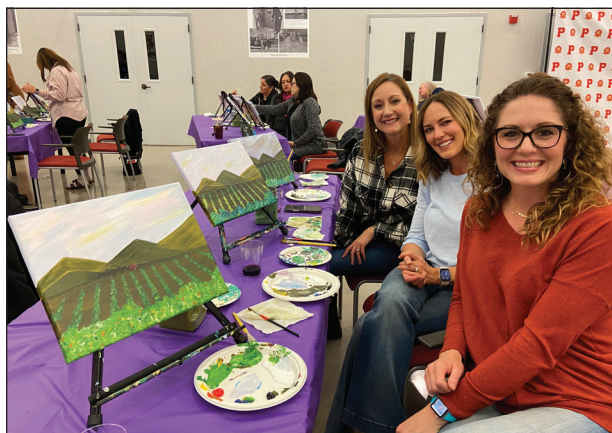
Paint Night on November 9th

PARENTS' CLUB WEB PAGE: HTTPS://PALMASCHOOL.ORG/PARENTS-CLUB/ EMAIL: PARENTSCLUB@PALMASCHOOL.ORG