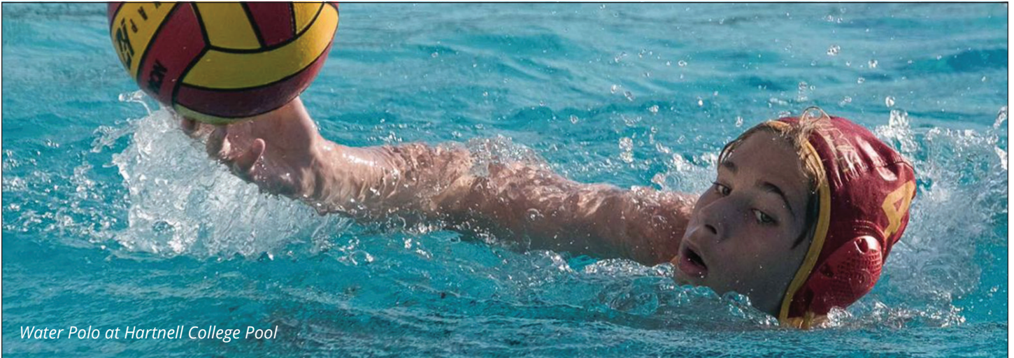
Water Polo at Hartnell College Pool