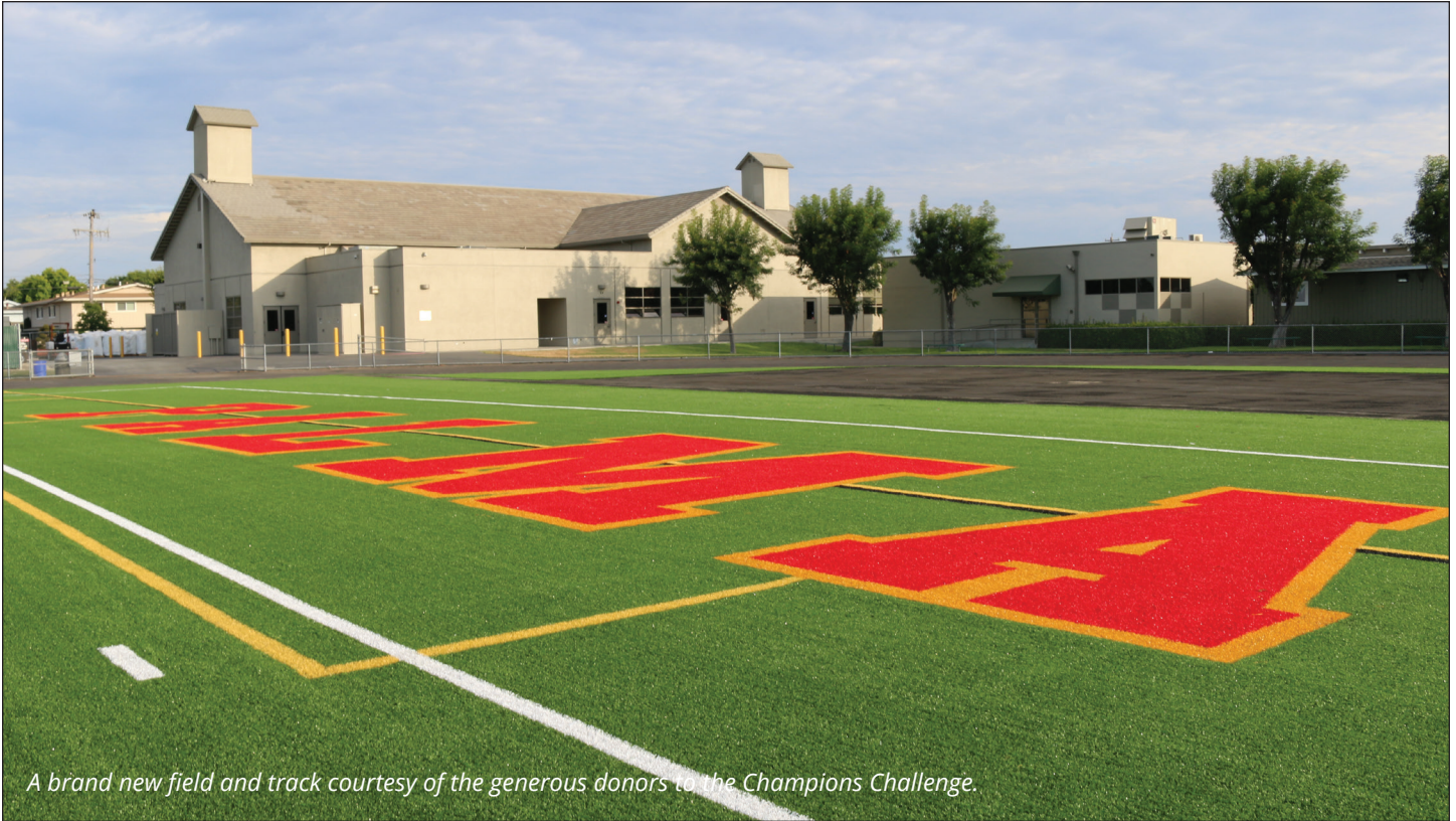
A brand new field and track courtesy of the generous donors to the Champions Challenge.