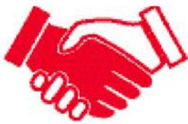
Know That You Matter