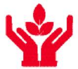
Nature & Ecology